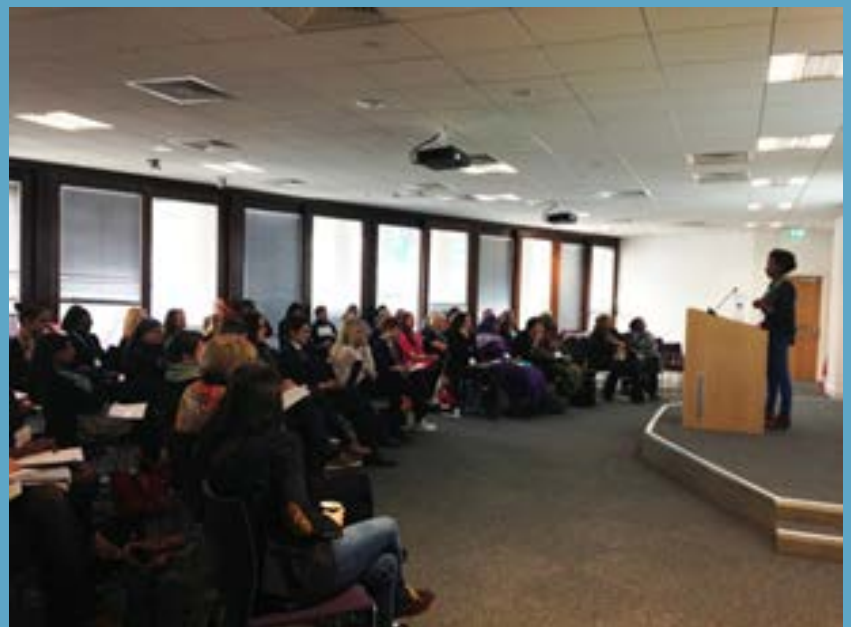
Leyla Hussein in the REPLACE 2 Conference in London.

www.replacefgm2.eu/conference/default.aspx